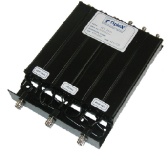
Mobile Duplexer DCL4533

Digital and analog wireless radio, low power repeaters, mobile full duplex radios, etc.